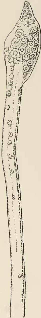
Fig. 2.— Melcagrotenthis separata sp. nov. distal half of left tentacle, \times 7 .

each series on this part being very thin. But from the middle of the arms to their tips the two series are close to each other, the distribution becoming very thick. The suckers of the right ventral arm are a little smaller than those of the three dorsal pairs and they are arranged from the extreme base of the arm, in a somewhat thicker series than those of the other arms. The left ventral arm shows many different features from all the others, this being probably due to deformity.